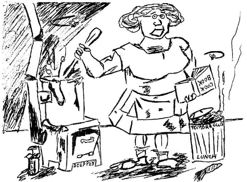
A well-equipped, well-trained cafeteria staff provides delicious meals every day.

Upon completion of the novel the reader is almost compelled to face the possibilities of corruption in the American Democracy. Seven Days in May has been described as nightmarish, wallowing, thrilling and important. It should be read seriously.