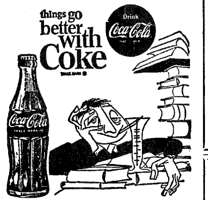
Richmond Coca Cola Bottling Co., Inc.